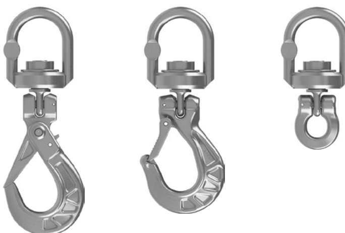
Fig.: Configuration examples, from left to right: CRCB combined with CGSL (self locking clevis hook), CGHF (clevis hook) and CGS (clevis shackle)

cromox ® products are developed and manufactured by Ketten Wälde GmbH, headquartered in Germany.